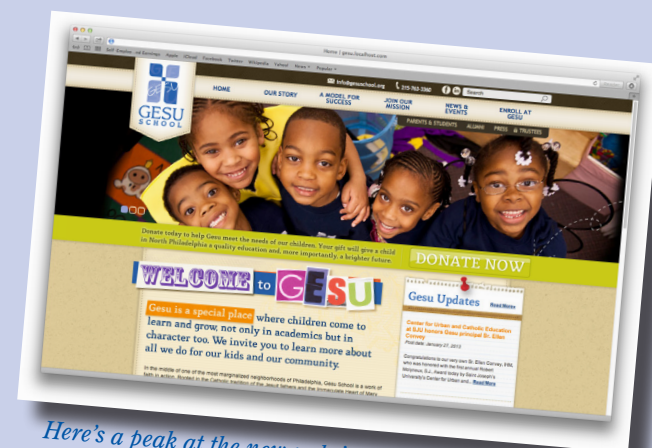
Here's a peek at the new website, designed and created by the talented team at Backe Digital Brand Marketing. Check it out at www.gesuschool.org !

Student artwork, the latest news stories, profiles of our teachers, upcoming events, the school handbook, registration information, ways to get involved—you'll find it all right here at www.gesuschool.org in a beautiful new user-friendly format. You might just find yourself calling Backe to say "thank you" for their great work, too!